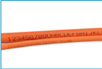
Wire & Cable